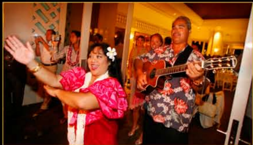
...everyone finishes the evening by dancing the hula