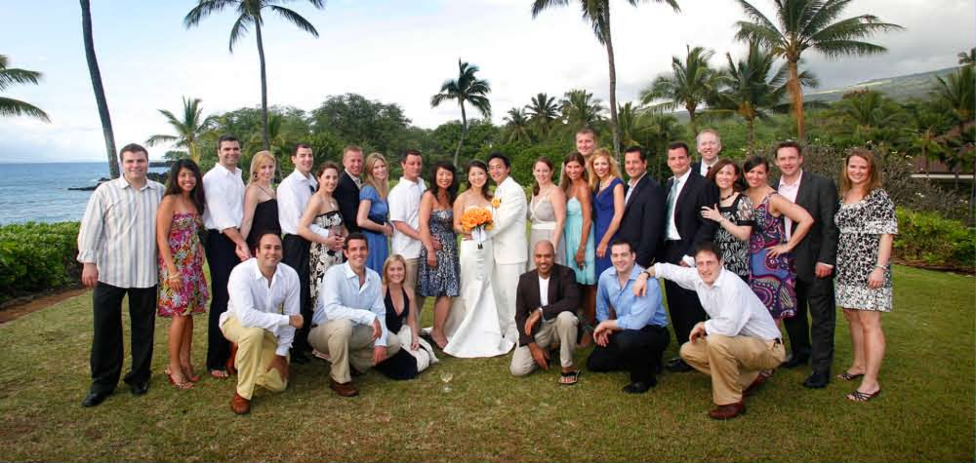
generations young and old